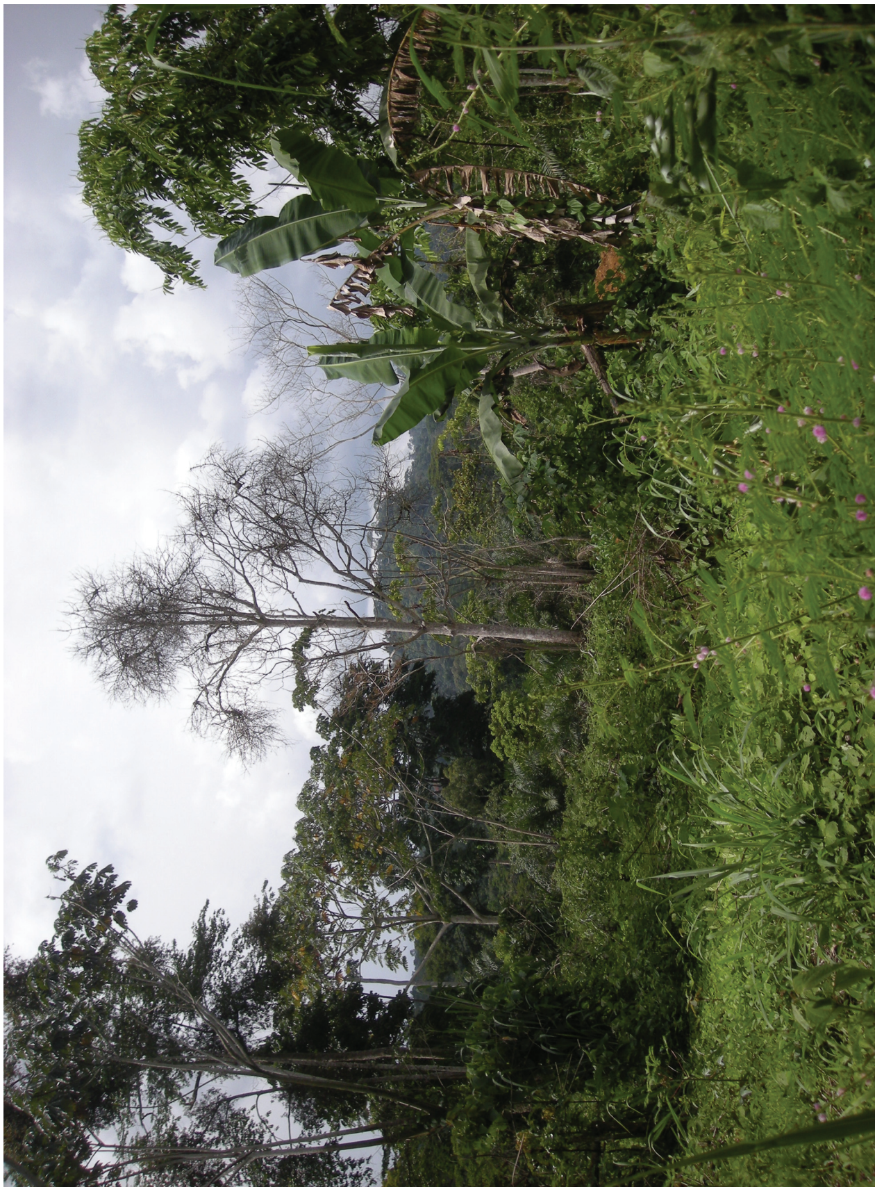
Photograph B for Question 4